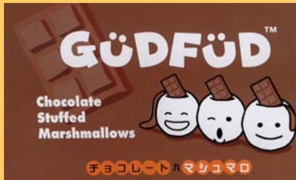
Introducing some of the first chocolate and jelly-filled marshmallows in the world.