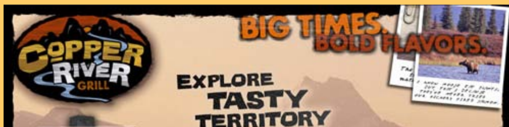
Exclusive restaurant sponsor